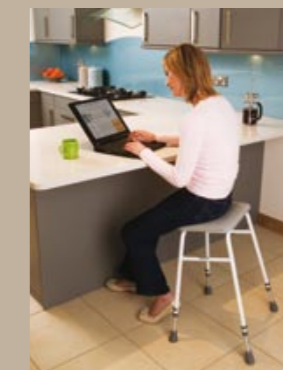
A traditional perching stool