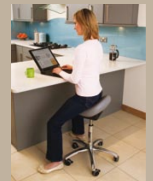
A Bambach Saddle seat